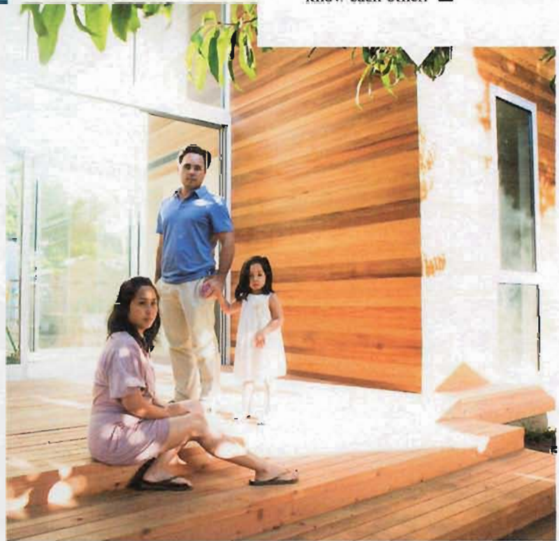
STEVEN EHRlich HOUSE