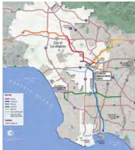
CleanTech Regional Location