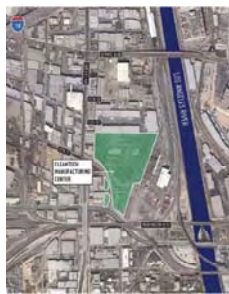
CleanTech Site at Alameda & 17th