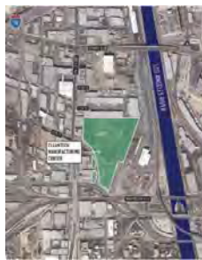
CleanTech Site at Alameda & 17th