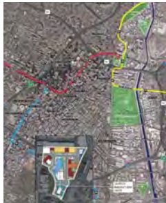
Clean Tech Corridor