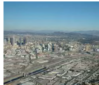
Downtown Los Angeles and the LA River